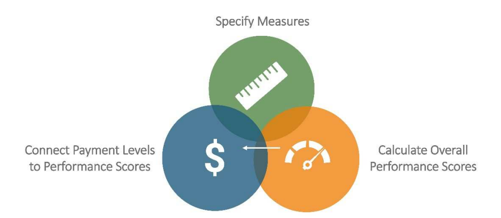
Figure 2: Components of Measurement Systems

By approaching the topic from the perspective of measurement systems and illuminating the idea that measures required for PBP models differ from those that have been useful under FFS payment, the Work Group hopes to chart new and fertile ground and drive alignments around broad-scale design elements in public and private sector PBP models—as confirmed by PBP-specific measurement systems.