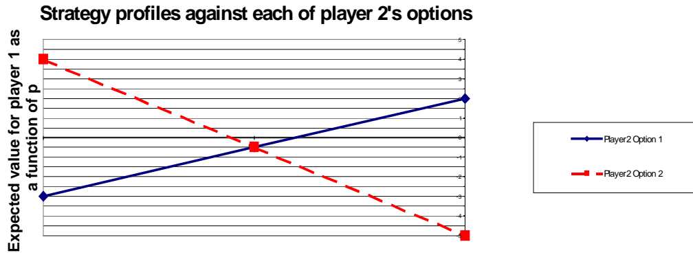
Figure 2. Maxi-Min [(1-p)Option1+ (p)Option2] sets p=0.5 , player 1 game value = -0.5