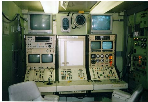
Figure 3-1. Typical Pioneer Ground Control Station consoles