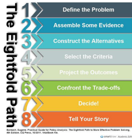
Fig. 2. 8-Step Process for Policy Analysis - Bardach

The Space Policy section of this metamodel provides the context and purpose for the three foundational components and is the keystone for the principles, technical, and vocabulary-based artifacts in ISRA overall. The Space policy component of ISRA must identify the primary producing stakeholder (owner) organizations that will contribute to ISRA and solution architectures that have or will utilize ISRA. It must also describe policy criterion that will be addressed. Understanding and consensus on the space policy criterion of the Reference Architecture will enable end-to-end traceability between organizational context and eventual implementation(s). Commonly accepted and practiced methodologies for policy analysis such as Bardach's 8 steps (Fig. 2) can allow for effectively implemented policy with Ex Ante and Ex Post evaluation mechanisms. Story Telling as the eighth step is critical to effective linkages between policy intent and effect on behavioral norms and standards of practice development. This aspect of ISRA is the most purposefully multi-disciplinary, intended to blend both policy and engineering worlds.