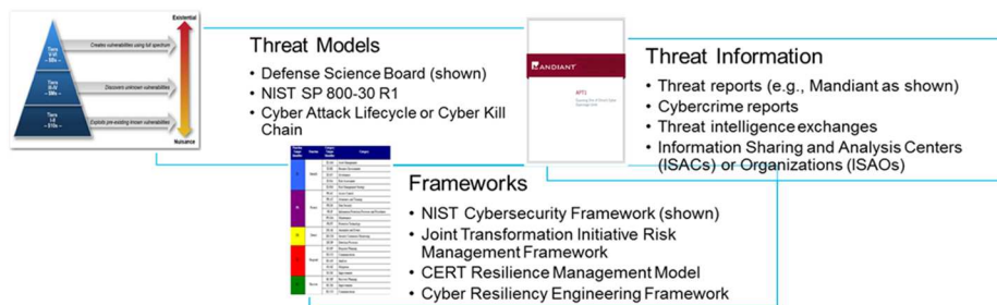
Figure 1. Organizations Must Navigate an Increasingly Complex Cybersecurity Landscape

At the same time, as depicted in Figure 1, the landscape of resources – frameworks, guidelines, information sharing efforts, and commercial services – related to cyber risk management continues to increase in size and complexity. Government has undertaken the transition from compliance-oriented to risk-management thinking, while the private sector and public-private partnerships have promulgated numerous cybersecurity-related frameworks and guidance. Threat information sharing – in the form of reports, mechanisms for automated exchange, and partnerships or other efforts – is recognized as vital to cyber defense.